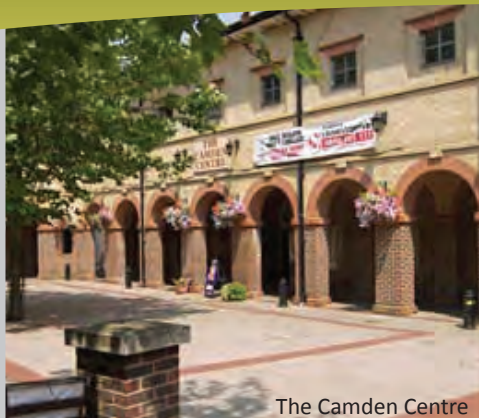
The Camden Centre

Email: office@ocduk.org Telephone: 0845 120 3778 (Voicemail messages will be returned within 24-48 hours).